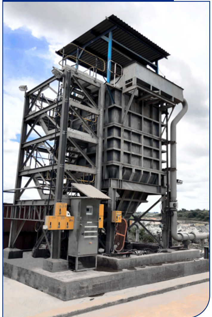
HRS-100 HIGH RATE CLARIFIER