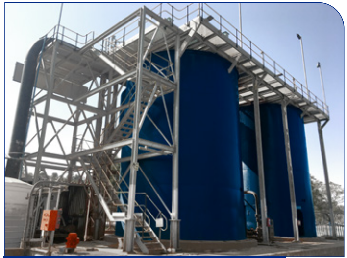
HIGH RATE CLARIFIER

AMD water is pumped from an unused mining shaft to the surface, to be treated in a neutralisation plant. The water is aerated for the oxidation of manganese, and then neutralised with hydrated lime in a series of concrete reactors. The neutralised stream is then pumped to the WCM High Rate Clarifier, from which the clear water overflow stream is discharged to the environment, and the underflow is discharged to an old opencast mining pit. (See Figure 1)